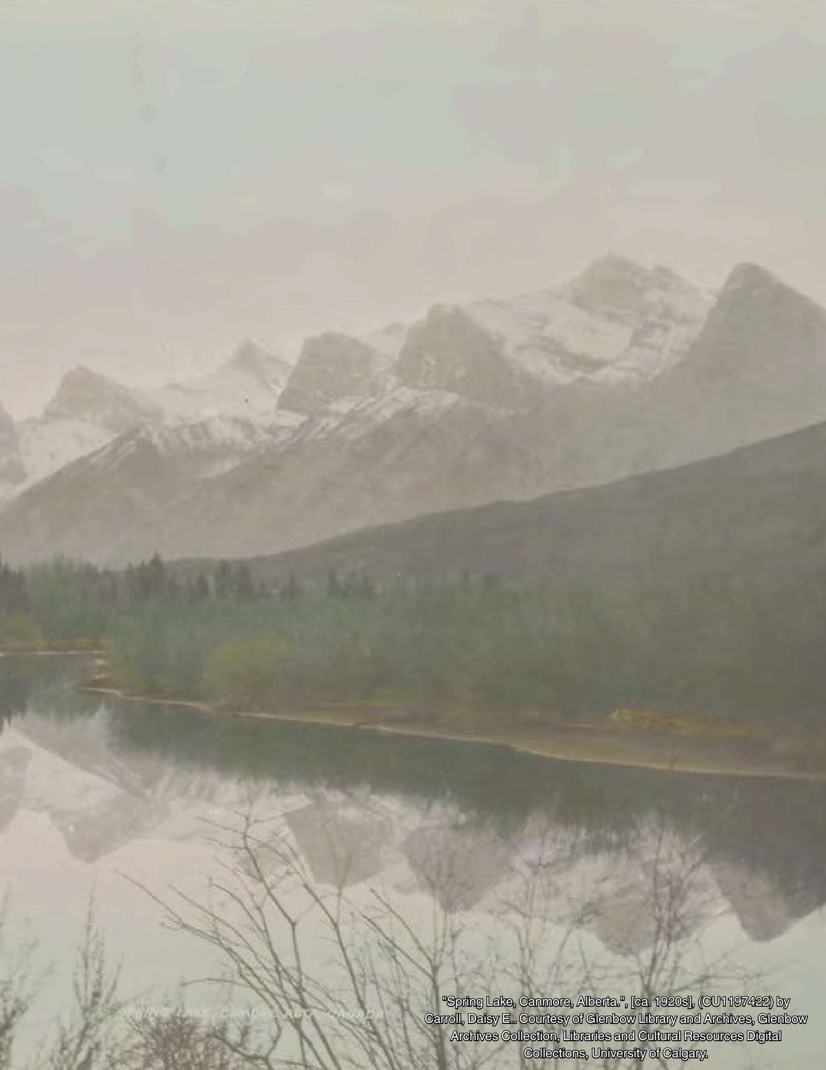
"Spring Lake, Canmore, Alberta.", [ca. 1920s], (CU1197422) by Carroll, Daisy E.. Courtesy of Glenbow Library and Archives, Glenbow Archives Collection, Libraries and Cultural Resources Digital Collections, University of Calgary.