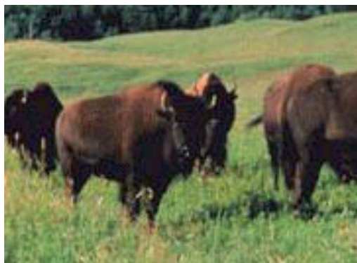
Bison, not Butch.